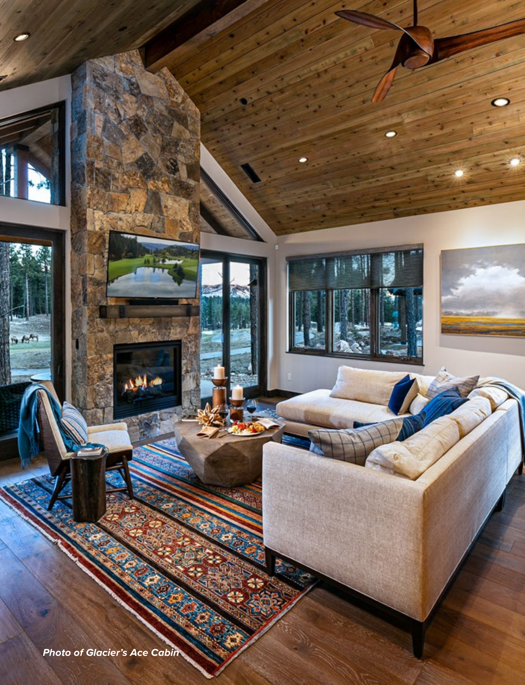
Photo of Glacier's Ace Cabin