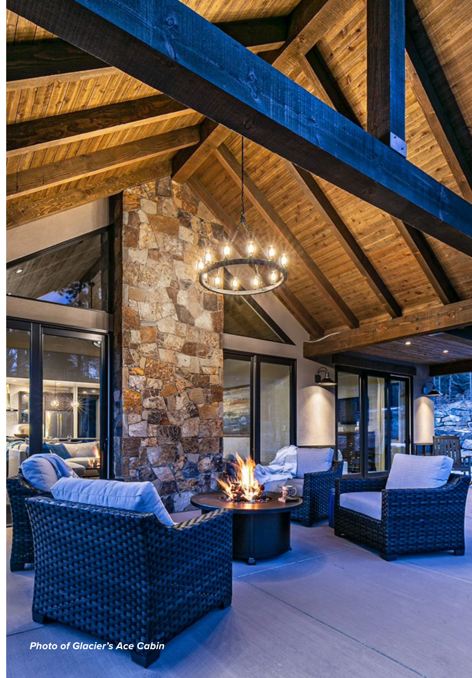
Photo of Glacier's Ace Cabin

Embracing a casual contemporary aesthetic, the Ironhorse Cabins' two- and three-bedroom floor plans are thoughtfully designed for year-round adventure seekers who don't wish to sacrifice today's luxuries. Each standalone cabin features a vaulted cedar ceiling, custom finishes and an open-concept floor plan that flows effortlessly outdoors to an expansive patio, offering a relaxing setting to soak up mountain and golf course views. With garage space for two cars and a golf cart, families are free to explore their 1,000-acre backyard, and beyond, with ease.