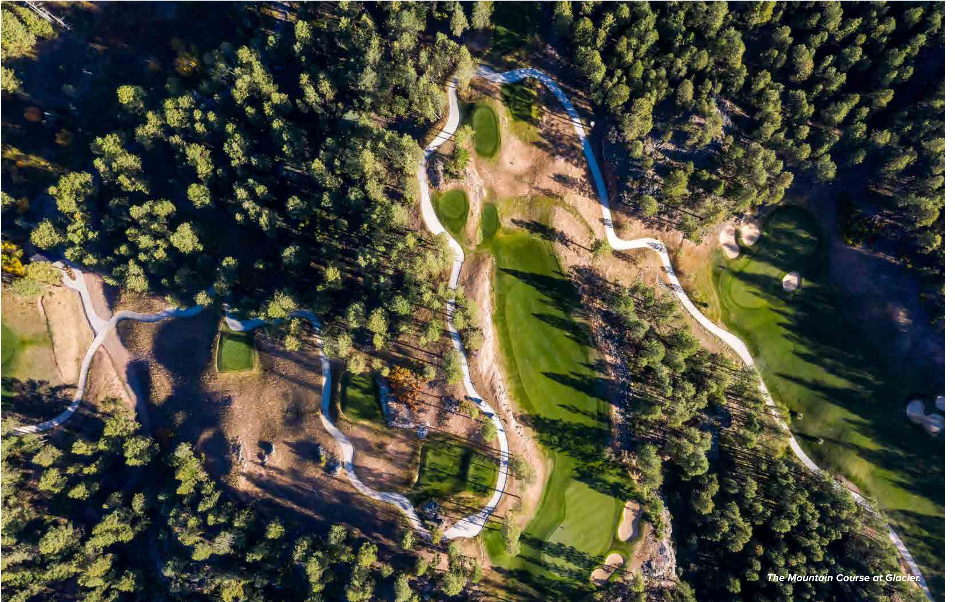
The Mountain Course at Glacier.